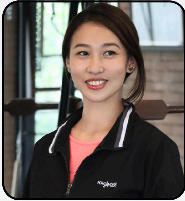
LOVE CAPIRAL MANILA